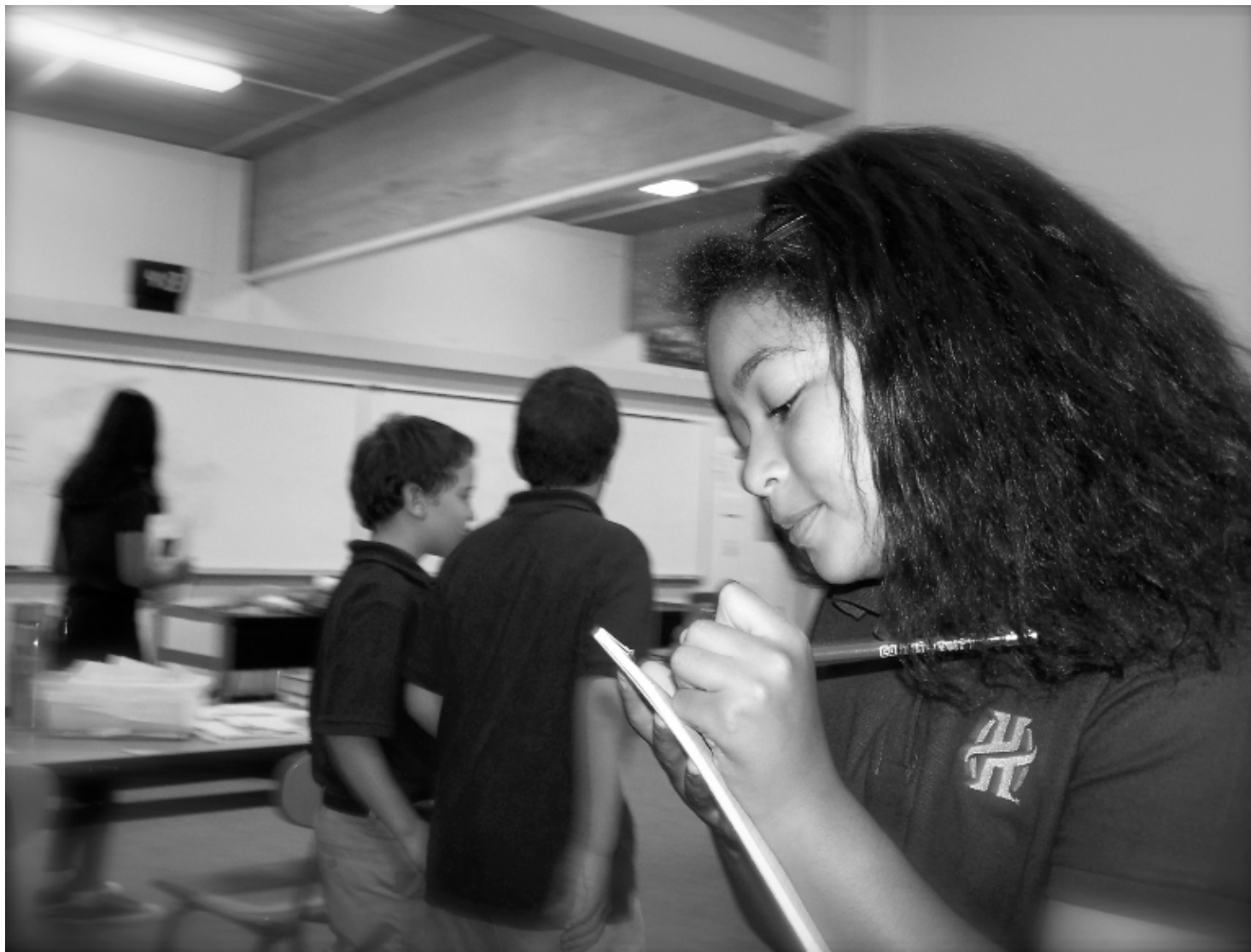
DUTCH BUZZ BULLPEN IN ACTION