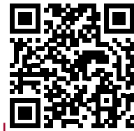
6th Grade Form

Current students have already completed the application process so they are only required to submit The Les and Ellen Goddard Merit Scholarship Program Application to the admission office. The applications are due by February 1, 2025 . Once all applications are received, applicants will be contacted to sit for an interview with the selection committee. Scholarship recipients will be announced by March 3, 2025 .